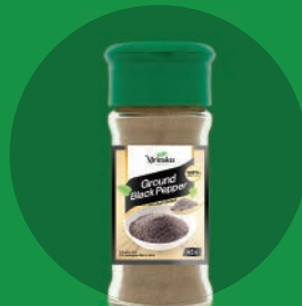
Ground Black Pepper Bottle Size : 45g $ 1,03