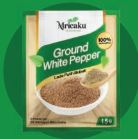
Ground White Pepper Sachet Size : 15g $ 0,38