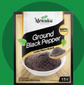
Ground Black Pepper Sachet Size : 15g $ 0,31