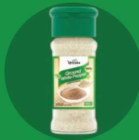
Ground White Pepper Bottle Size : 45g $ 1,17