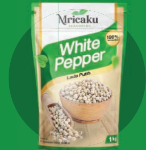
White Pepper Size : 1Kg, 5kg, 10kg $ 11,38 /kg*