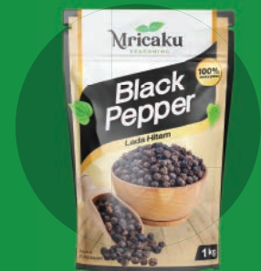
Black Pepper Size : 1Kg, 5kg, 10kg $ 10,69/kg*

*XXX USD/kg; price is negotiable with condition of currency exchange and demand quantity